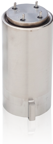
Case and header 304 stainless steel, terminal nickel iron alloy hot soldered