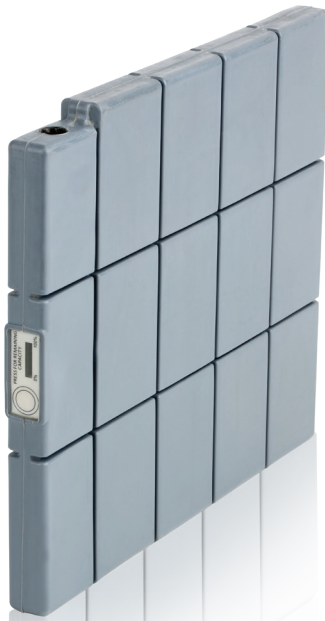
Lithium/CF x -MnO 2 Hybrid Battery

Flexible battery is conformable to many surfaces while providing high energy storage in a lightweight package