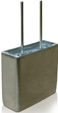
Lithium Thionyl Chloride Battery