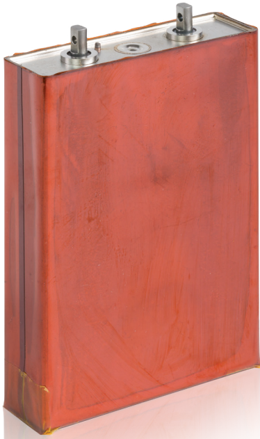
Lithiated Nickel Cobalt Aluminum Oxide

High energy, long cycle life and low maintenance lithium-ion cell for demanding applications