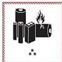
Lithium Battery Mark Figure 3