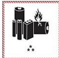
Lithium Battery Mark Figure 3