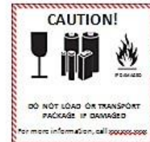
Lithium Battery Label Figure 4

Shipper must complete phone number portion of label.