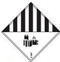
Lithium Battery Class 9 Hazard Label Figure 1