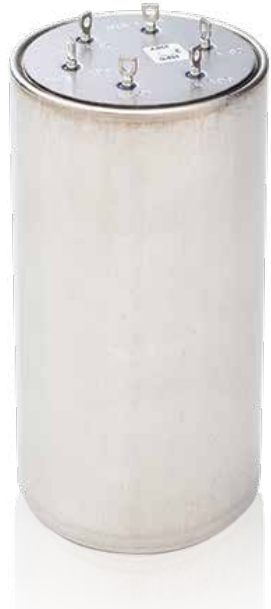
Thermal battery: lithium silicon/iron disulfide (LiSi/FeS 2 )