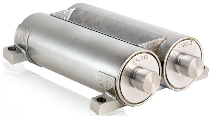
Lithium Silicon/Iron Disulfide Case and Header 304 Stainless Steel